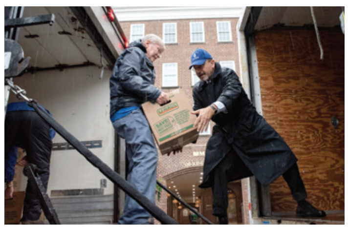
Volunteers pass a box of food from the diocesan Catholic Charities St. Lucy Project truck to the ALIVE! truck outside Alexandria City Hall