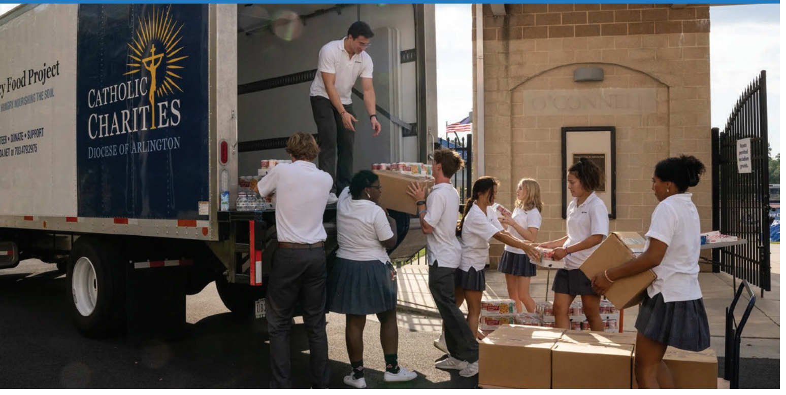
Senior student leaders from Bishop O'Connell High in Arlington load boxes of soup cans onto the truck.