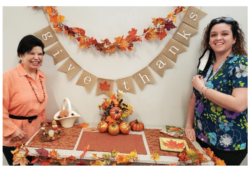
A happy mother picking up gift cards before going to work.

THANKSGIVING IS A BOUNTIFUL feast of plenty. But for vulnerable families in our diocese struggling to pay their rent, keep the lights on, and afford gas to get to work, the holiday presented additional stress.