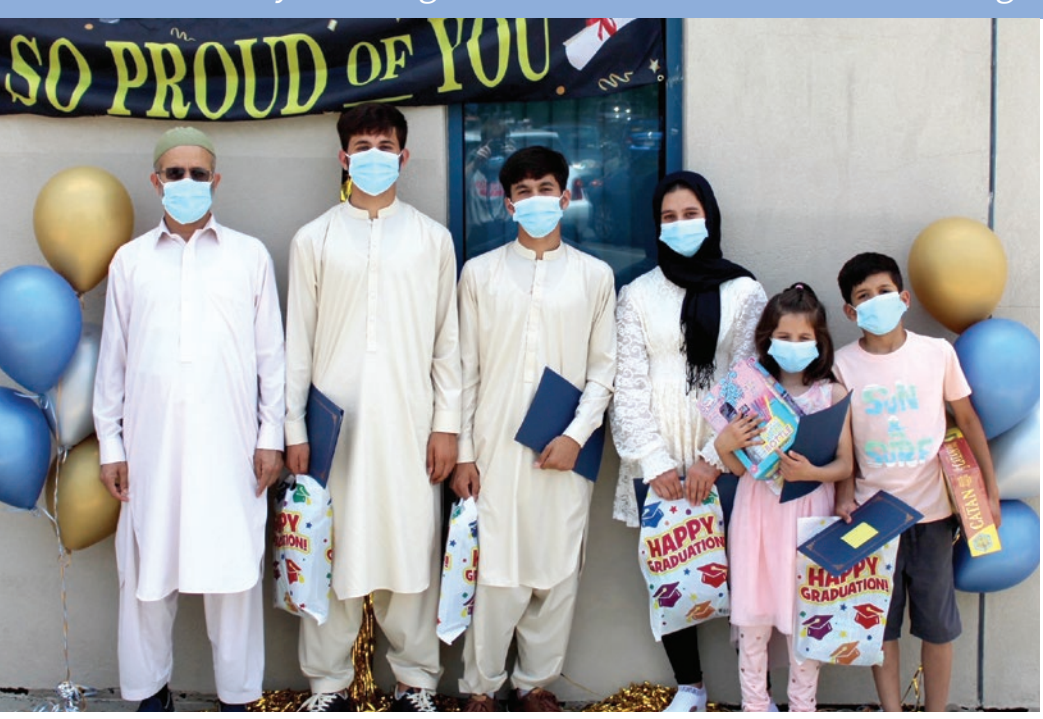
Catholic Charities clients include Afghan refugees with Special Immigrant Visas. With your support, we welcome them into their new home.

Faithfully Serving in 100 Locations Across 21 Virginia Counties and 7 Cities!