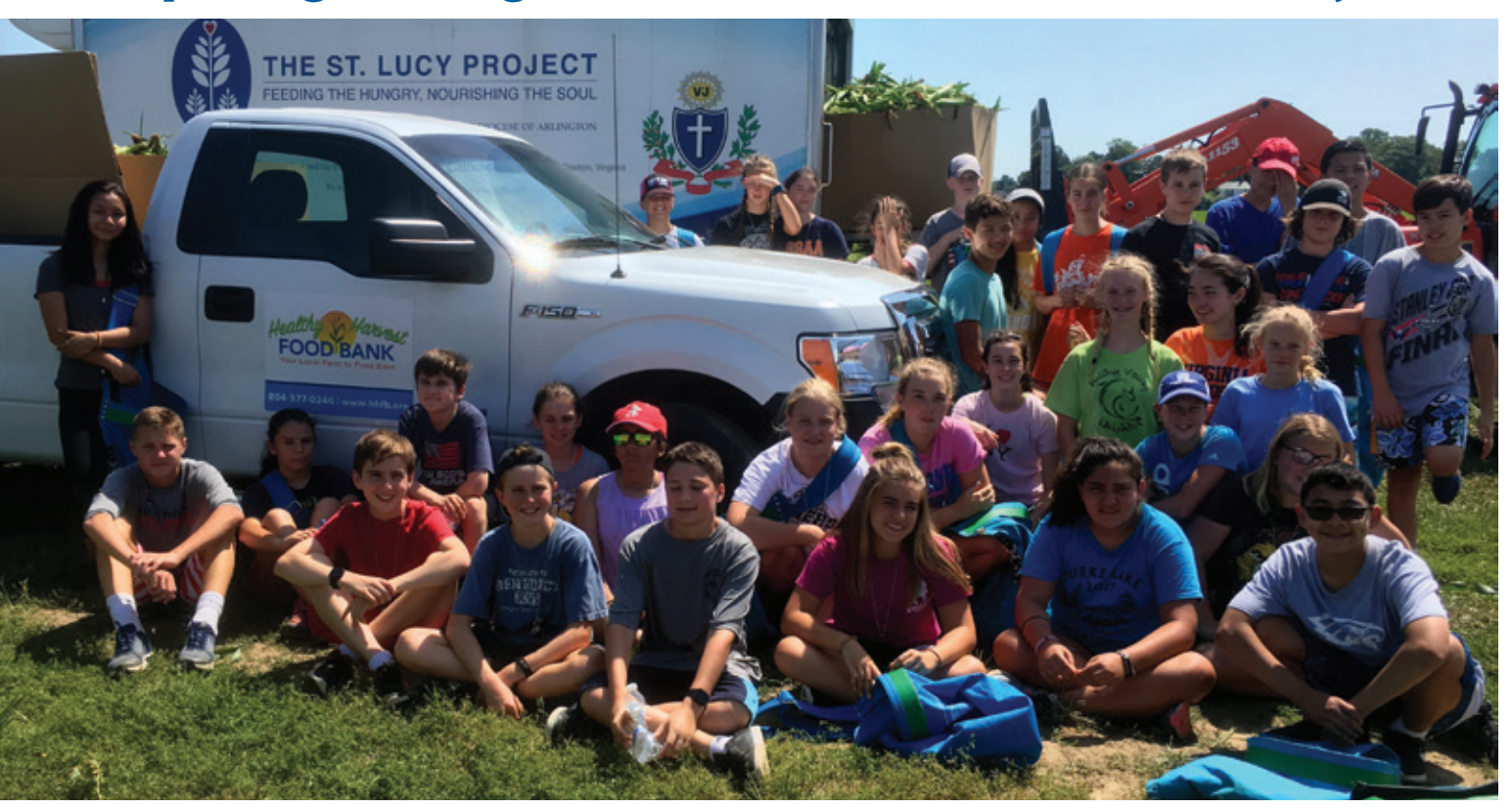
Students take a much needed break and pose for a photo after spending over two hours picking 10,294 pounds of corn.