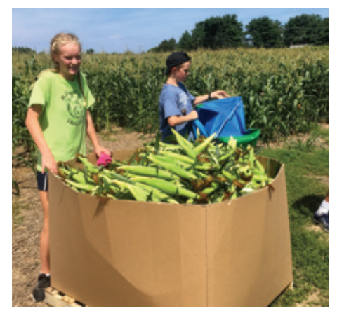
The corn collected was left in the husk to keep it from getting damaged during transport to three Catholic Charities pantries and several partner pantries.

From there, the corn was distributed to three Catholic Charities pantries, Loaves & Fishes Pantry in Front Royal, Warren County; Christ House in Alexandria city; and the Leesburg Pantry in Loudoun County. It was also sent to partner pantries in the following counties and cities: Rappahannock, Shenandoah, Winchester City, Madison County, Orange County, Fairfax County, and Arlington. In addition, Healthy Harvest Foodbank is distributing some of the corn to the Northern Neck.