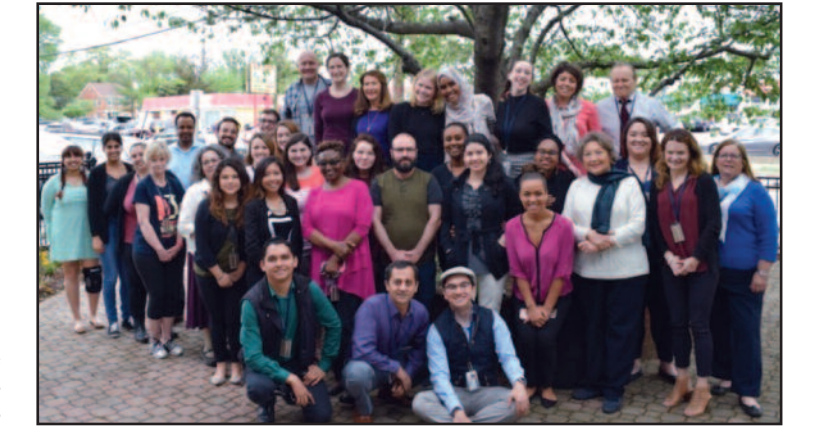
Migration and Refugee Services Volunteers

We need you to join Catholic Charities in making a difference in the lives of the poor! There are a variety of ways to give back — with the St. Lucy Project and with all of our programs. Your gifts of time, talent and treasure are priceless. To volunteer with Catholic Charities, please sign up on our volunteer page or contact Sally O'Dwyer at (703) 841-3838 or SO wyer@ccda.net. To make a financial donation, please make a gift online.