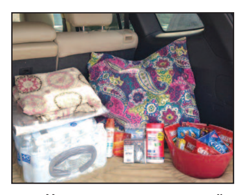
Here are some emergency supplies you can keep in your car.

85% of people would help someone if they thought they were the only one there. Next time you are that one person who can help, be prepared!