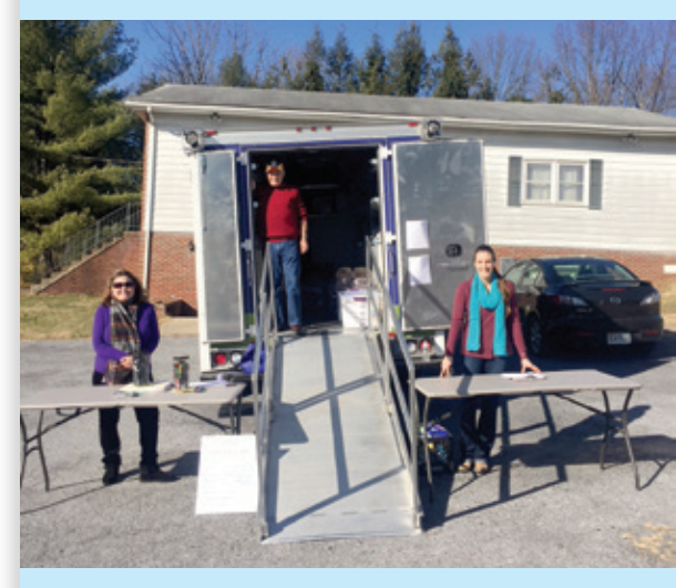
Catholic Charities staff and volunteers set up the van to distribute donated goods to families in need.

This past December, the St. John Bosco Outreach Center in Woodstock, Virginia welcomed the new Mobile Response Center to provide donated goods to the community.