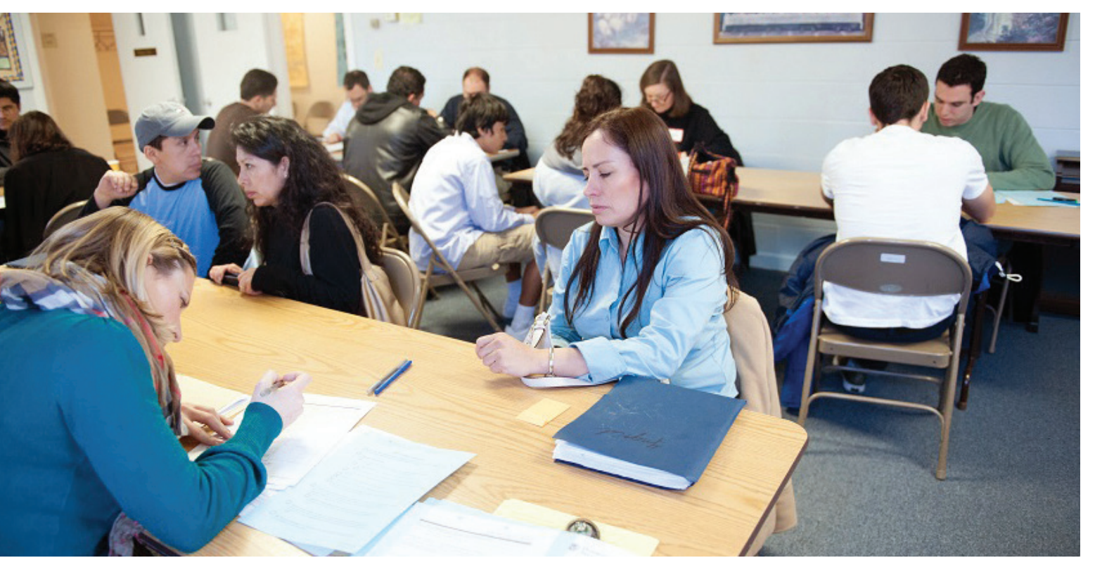
Volunteers assist lawful permanent residents ("green card holders") complete the application and other forms required to become American citizens at a recent naturalization workshop.