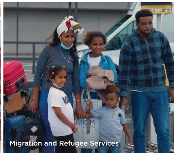
Migration and Refugee Services

Every day, through God’s grace and with the support of parishes, Catholic Charities serves poor and vulnerable neighbors in communities throughout the 21 counties and seven cities of the Diocese. During the “COVID-19 years”—the last quarter of 2020 and all of 2021—we served more people and provided more food and more funds for rent and utilities than ever before. Yet, in FY 2022, as workplaces, schools and restaurants slowly reopened, the requests for assistance continued to significantly exceed pre-COVID numbers. While employees were going back to work, many were returning to jobs with work hours greatly reduced. They were also battling inflation: gas, groceries and rent have all increased.