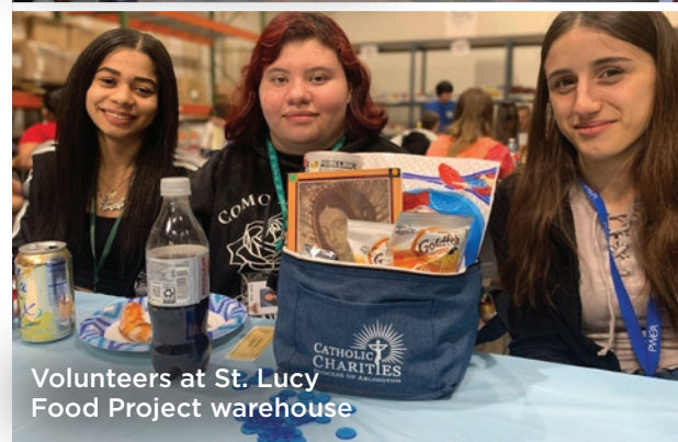
Volunteers at St. Lucy Food Project warehouse