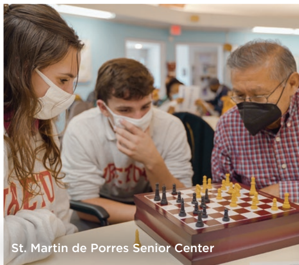
St. Martin de Porres Senior Center