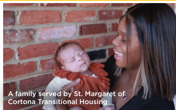
A family served by St. Margaret of Cortona Transitional Housing