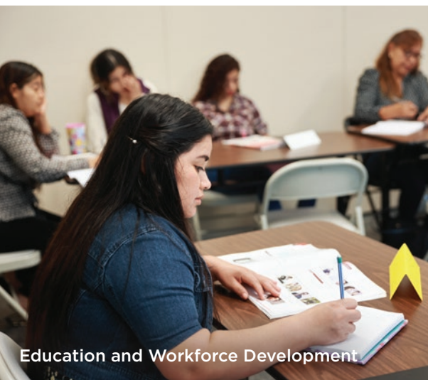
Education and Workforce Development