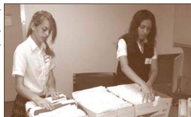
Volunteer students from St. Thomas More Cathedral School help organize files.