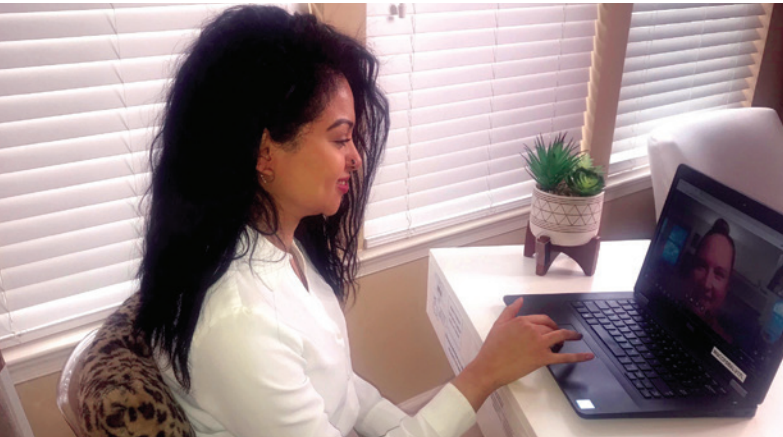
Catholic Charities teletherapy sessions enable people who live in rural areas or have transportation issues to receive counseling.

L AST YEAR CATHOLIC CHARITIES provided mental health counseling to more than 1,100 clients at three Catholic Charities locations and 18 parish offices. But when the pandemic hit Northern Virginia this spring Family Services mental health staff knew they'd have to adjust quickly.