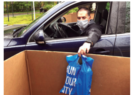
A man deposits his food donation at the Friday no-contact drive thru food drive at St. Bernadette Catholic Church.