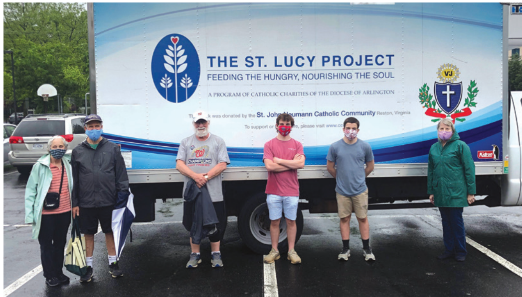
St. James Catholic Church volunteers assist at a Friday no-contact drive through food drive.

And soon after Easter, parishes throughout the diocese signed up to host mask-wearing, parishioner-led Friday no-contact drive thru food drives in their parish parking lots. Each drive collected between 5,000 and 7,000 pounds of food, with two parishes – St. Joseph of Herndon and St. Bernadette – coming up as two of St. Lucy’s “heavy hitters”. †